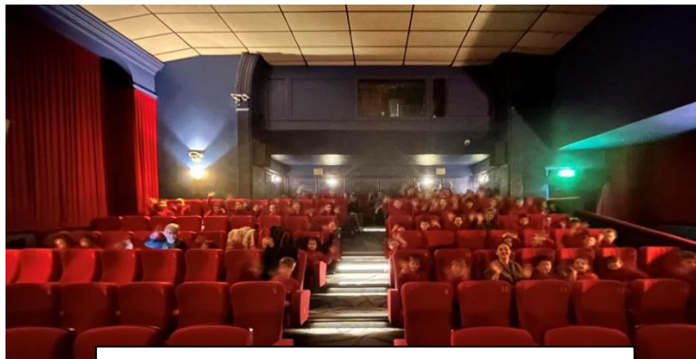
Cinema visit as part of the 'Into Film Festival'.