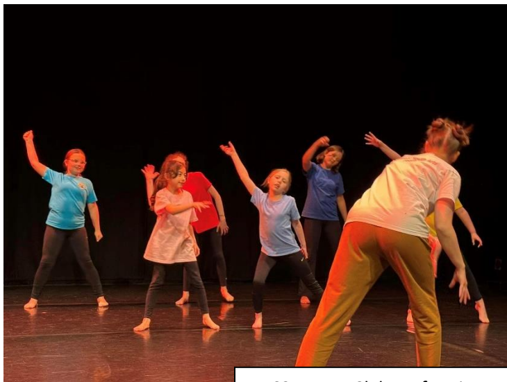
KS2 Dance Club performing at the Brewery Arts Centre, Kendal.

Thank you to the parents who returned slips showing an expression of interest in this club. Unfortunately, the numbers of replies received were too low for the tutor to go ahead with it on this occasion.