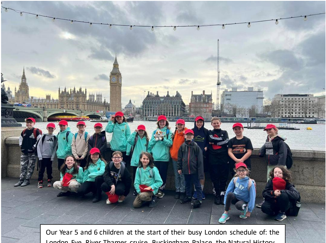
Our Year 5 and 6 children at the start of their busy London schedule of: the London Eye, River Thames cruise, Buckingham Palace, the Natural History Museum, St Paul's Cathedral, a trip to the West End to see Matilda and a guided tour of the Houses of Parliament.