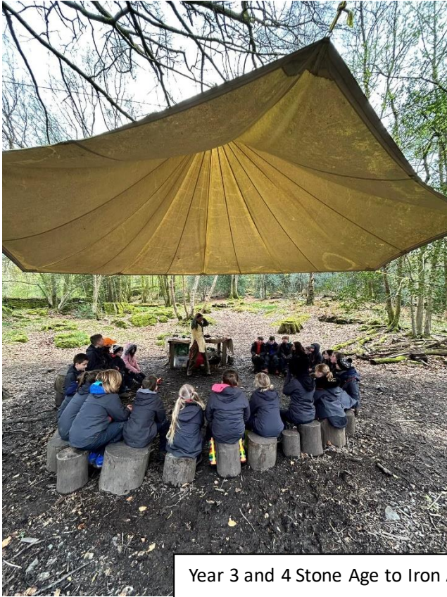
Year 3 and 4 Stone Age to Iron Age Day