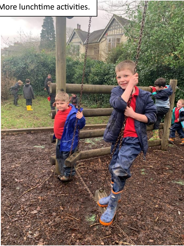
More lunchtime activities.